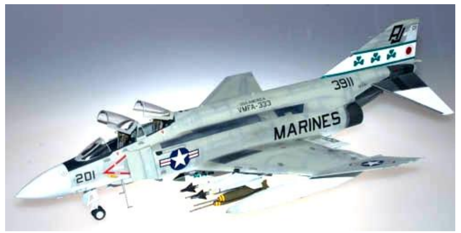
Rick's F-4J VMFA 333